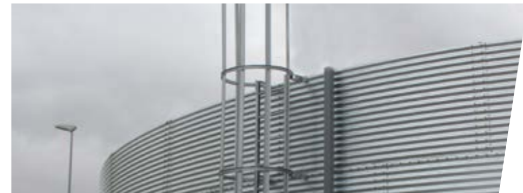
ACCESS LADDER WITH SAFETY CAGE