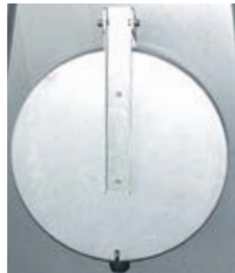
ROOF INSPECTION DOOR