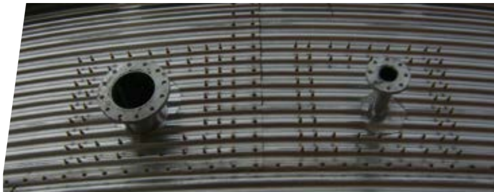
INLET AND OUTLET CONNECTIONS